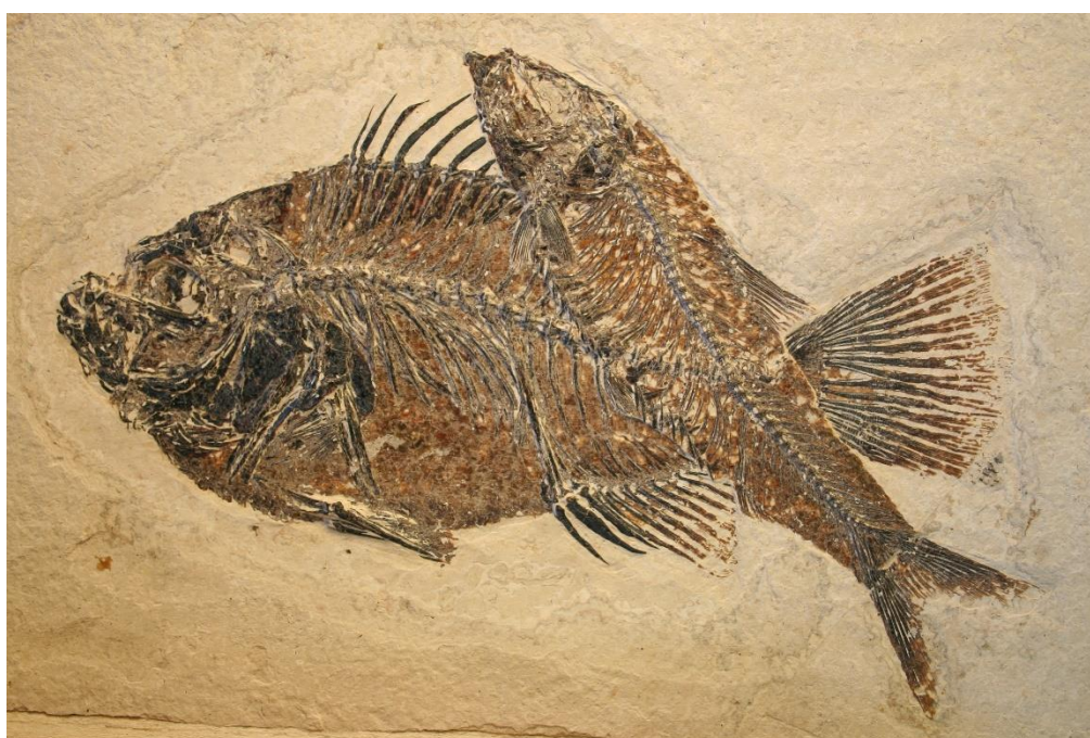
Figure 41: The ray-finned fish Diplomystus and Priscacara from the Eocene Green River Formation, Wyoming (Cockburn Museum).

Named corals are Thamnastraea , Astrea , Stylina , Asterophyllum , Cyclolites , Thecosmilia , Montlivaltia , Heliolites , Syringopora , Halysites , Favosites , Thamnopora , Alveolites , Cyathophyllum , Ketophyllum , Arachnophyllum , Heliopora , Diphyllum , Omphyma , Heliopora , Cyathophyllum , Acervularia , Ketophyllum , Phillisastrea , Sphenotrochus , Isastrea (Jurassic) and Turbinolia (Gault of Folkestone), with other corals from the Red Crag of Suffolk; these cover typical taxa from throughout the geological timescale, especially the Silurian, Carboniferous and Jurassic. One coral has a label 'Epis. Corallien Wilts, F.H. Burier 1892'. Lower numbers of fossils represent stromatoporoids, stromatolites, foraminifera, diatoms, radiolaria and sponges, notably Raphidonema and Barroisea from the Cretaceous Faringdon Sponge Gravels with taxa from the Jurassic (Lyme Regis), Cretaceous Greensand and Chalk, and Pliocene among others.