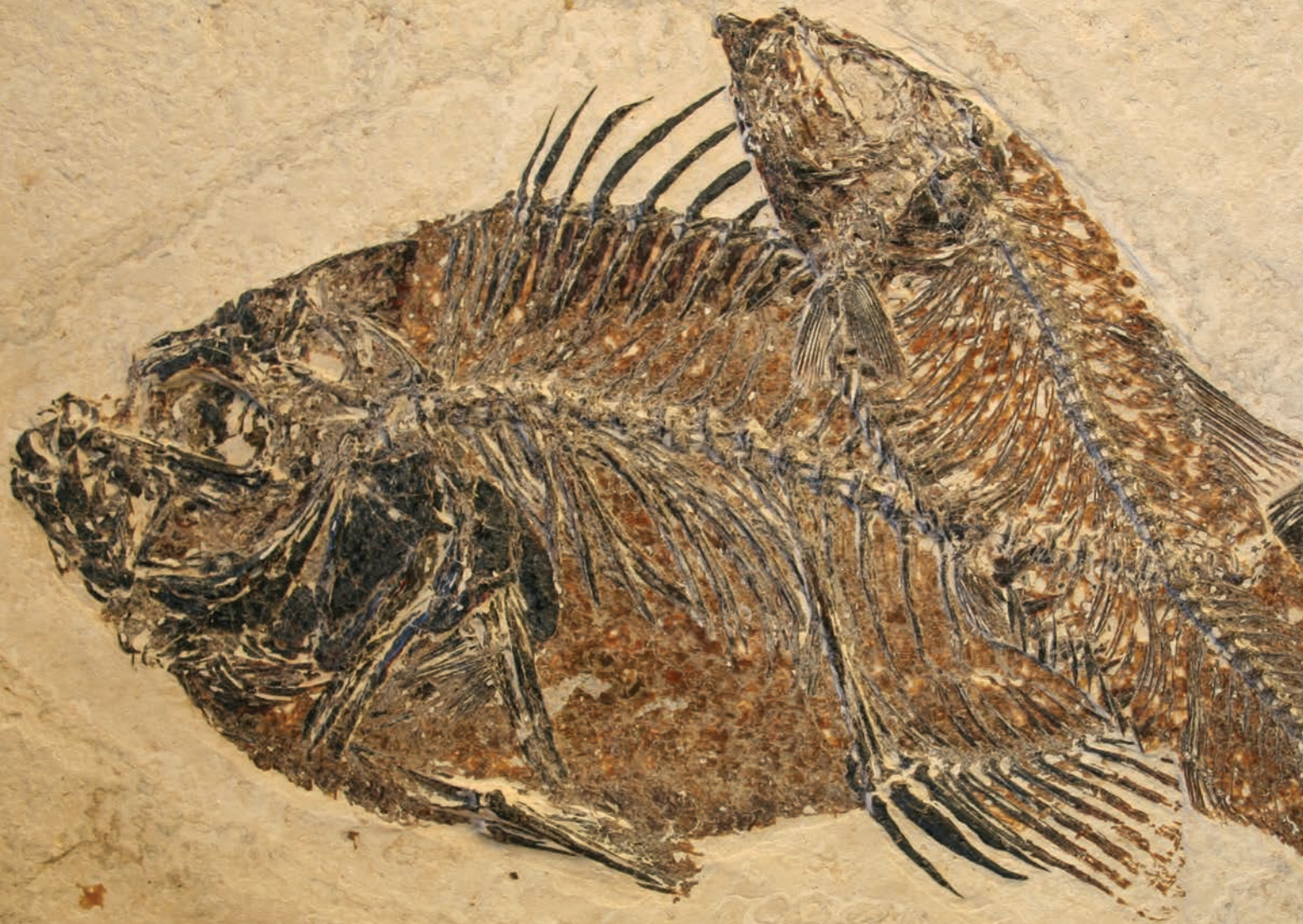
Detail of the Eocene fish Diplomystus and Priscacara from the Green River Formation, Wyoming. Yvonne Cooper © Cockburn Museum