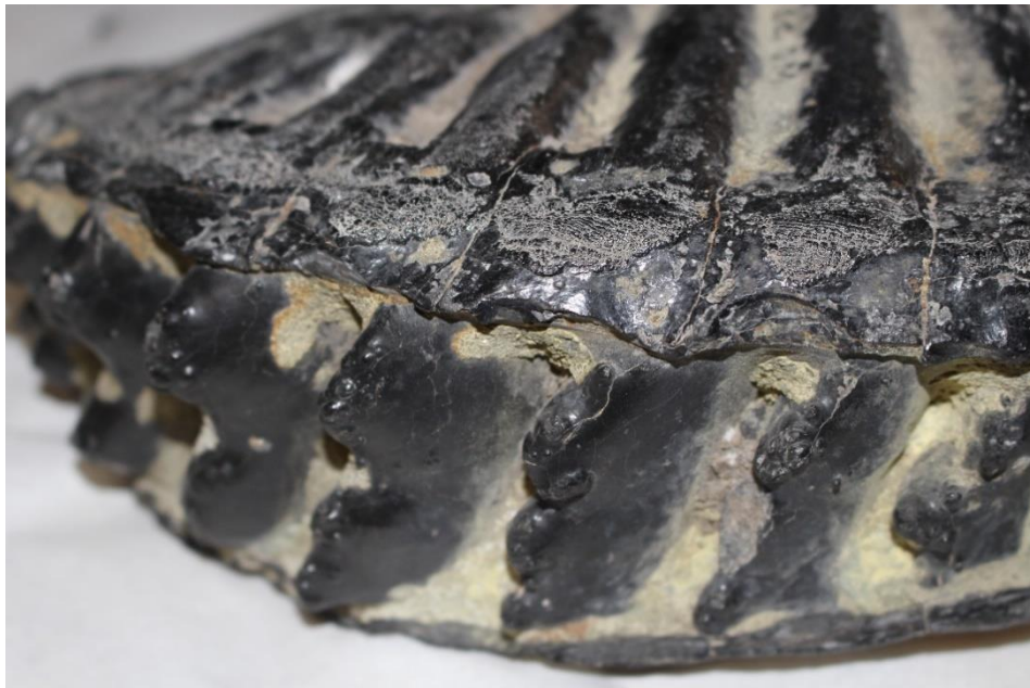
Figure 44: Detail of Mastodon tooth from Beaufort, South Carolina (Anatomical Museum)