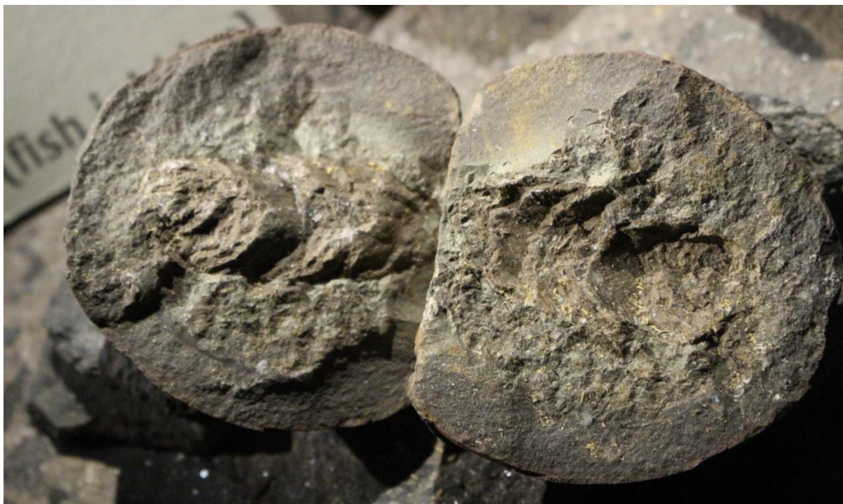
Figure 39: A coprolite part and counterpart in a Carboniferous nodule (Almond Valley Heritage Centre)

As the Museum is focused on the shale oil industry in the West Lothian area, the fossils are almost entirely from the Carboniferous locally, specifically the Calciferous Sandstone Series. Plant fossils include Calamites , Lepidodendron , other fronds and indeterminate fragments (Fig.38). There are several large sections of tree trunk, possibly from the local area. Vertebrates are represented by the fish Eurynotus , Mesopoma and Rhadinichthys among others, with many in split nodules comprising part and counterpart pieces. Additional nodules contain coprolites (Fig. 39). There is also a rare fossil of the amphibian Eldeceeon rolfei , on long-term loan from National Museums Scotland. Invertebrate fossils include a eurypterid head, crinoid stem fragments, bivalves and corals.