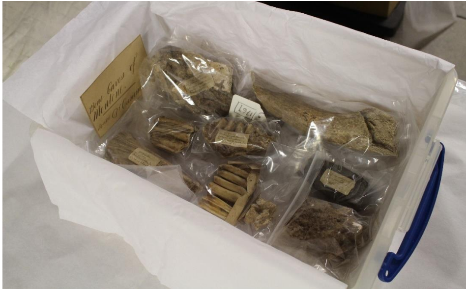
Figure 43: Mammal teeth and bone fragments from the Mentone Bone Caves, France (Anatomical Museum)

Studies of the mastodon tooth from Beaufort South Carolina, presented by Dr Batty Duke, are suggested. Although the label states it is a genuine fossil, the form of the black-coloured ridges on the processing surfaces and the coating of sandy, yellow-coloured grains suggest that this may be a cast or reproduction. Examination of the specimen could be followed up with further investigation of the collector and the excavations to determine context and whether other material was recovered from the same locality.