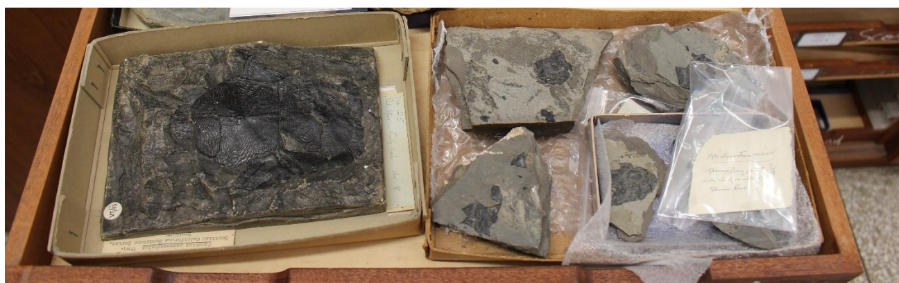
Figure 40: The cast of the Upper Devonian Phyllolepis (left) and fragments of Middle Devonian Millerosteus from Thurso (right) (Cockburn Museum)

A noted fish specimen comprising several articulated and ornamented plates has two labels, the first reading ' Canobius microcephalus from the Scottish Calciferous Sandstone Series, Broxburn' and the second ' Phyllolepis Upper Devonian, near Elgin, Scotland' (Fig.40). The Phyllolepis identification is more likely, although not the origin, as the specimen matches exactly a Phyllolepis woodwardi in the Australian National University Collection, Canberra, figured in Young (2005, fig 2). The figured specimen is a cast of the holotype originating from Dura Den and described by AS Woodward (1915, fig 4). The consistent colour and edges of the specimen in the Cockburn Museum suggest this is also a cast.