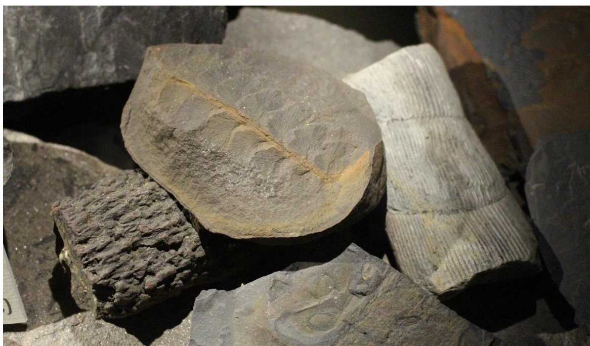
Figure 38: Carboniferous plant fossils on display (Almond Valley Heritage Centre)

Smithson, T.R. (1993). Eldeceeon rolfei , a new reptiliomorph from the Viséan of East Kirkton, West Lothian, Scotland. Earth and Environmental Science Transactions of The Royal Society of Edinburgh . 84:377-382.