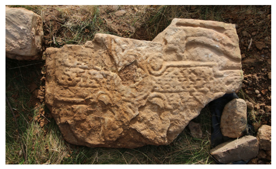
Fragment of Early Historic Pictish cross slab found at Deerness.

The Orkney Museum acquired a fragment of a Pictish cross slab which was spotted eroding from a cliff face at Deerness. One face bears interlace design and an S-dragon while the other has depictions of two Pictish beasts. This is one of only three Pictish cross slabs known from Orkney.