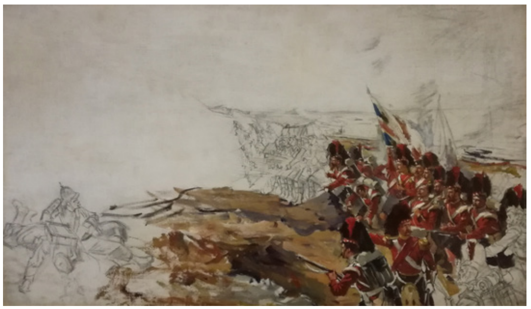
Oil sketch, Forward the 42nd, by Robert Gibb. © Black Watch Castle and Museum.

The Black Watch Castle and Museum acquired a preparatory oil sketch by Robert Gibb (1845– 1932) for the finished composition Forward the 42nd which is now in the collection of Glasgow Museums. This famous painting, exhibited at the Royal Scottish Academy in 1899, depicts the Battle of the Alma on 20 September 1854, during the Crimean War. The oil sketch shows the 42nd Highlanders (the Black Watch) attacking on the right of the Allied positions towards the end of the battle during which Sir Colin Campbell, leading the Highland Brigade, gave the famous order 'Forward the 42nd!' The acquisition helps to tell the story of one of the most important events in the history of the regiment, marking their first action since the Battle of Waterloo in 1815.